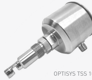
OPTISYS TSS 1050-3050