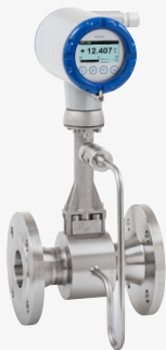
OPTISWIRL 4200 flanged

For liquids, steam, gas or compressed air