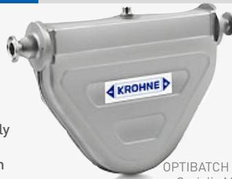
OPTIBATCH 4011 C Coriolis Meter