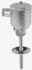
Sanitary Sensor Assemblies