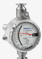
H250 F M40

All metal instruments specially designed for use in the food and pharmaceutical industries