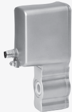
BATCHFLUX 5500 C Magmeter