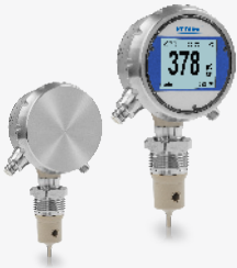
OPTISYS IND 8100

Waste water version of total solids sensor for early detection of product loss