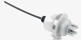
OPTISENS TSS 7000