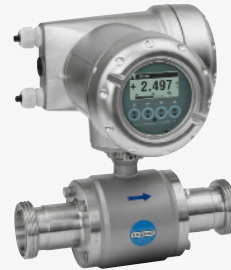
OPTIFLUX 6300 PMO Meter

KROHNE is the world's largest producer of magmeters with the widest diameter range from 1/10" to 120" and the broadest selection of liners and electrode materials available for all applications.