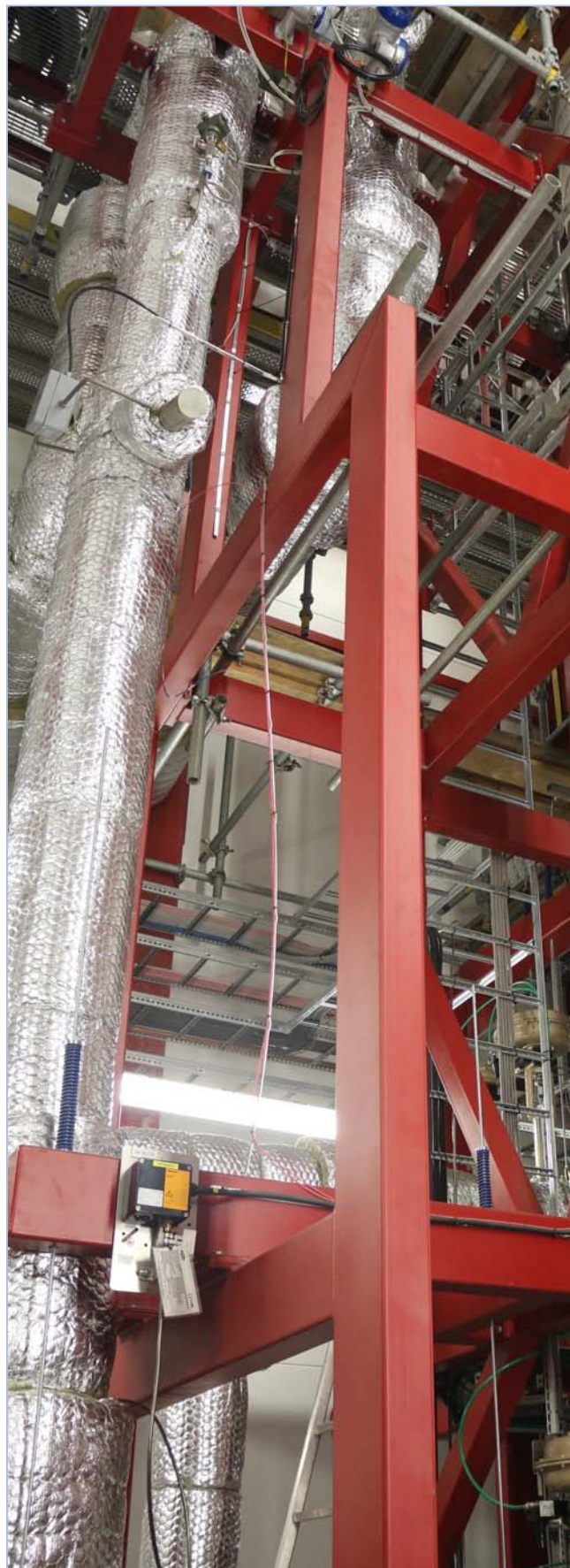
Ultrasonic flow measurement of a high temperature hydrogen/steam mixture

The OPTISONIC 8300 once again proved to be a reliable high-performance meter for CO 2 and H 2 , which makes it a solid option in follow-up projects. The KROHNE flowmeter even enables the customer to determine the gas composition of two mixed gases based on the velocity of sound. Though currently not an issue for TNO, real-time analysis of the gases that pass through the pipes would be possible just yet without additional flowmeter installation, making the OPTISONIC 8300 not just a flowmeter, but a compact device for the real-time analysis of gas compositions.