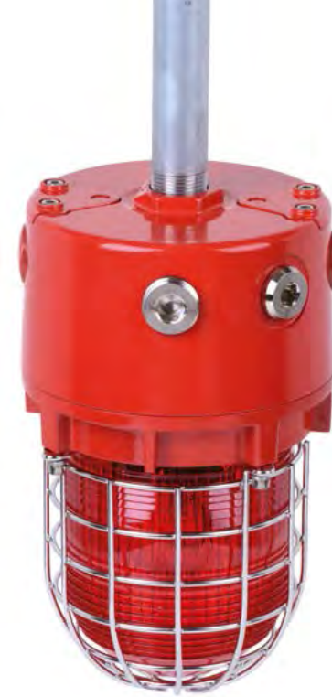
D1xB2 beacons - pendant mounting