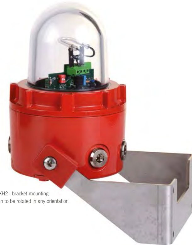
D1xB2XH1/XH2 - bracket mounting allows beacon to be rotated in any orientation