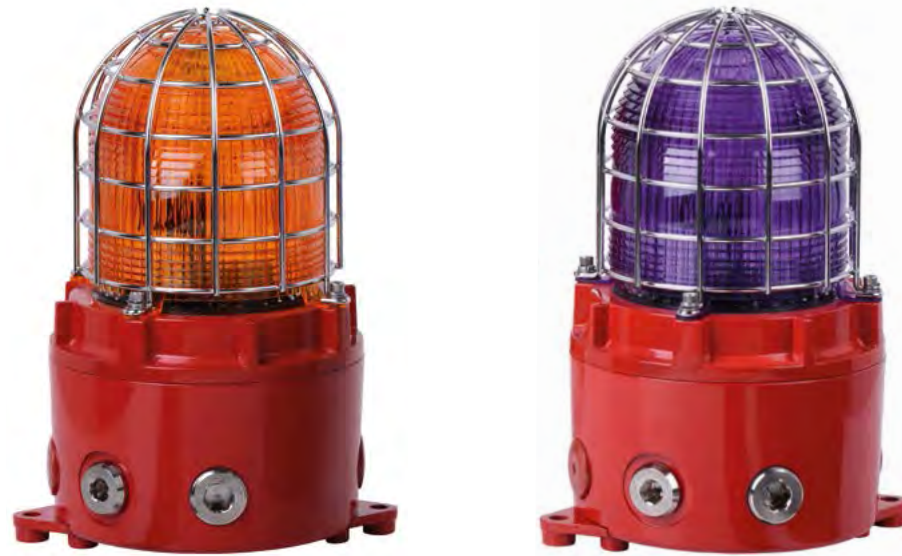
D1xB2 beacons- surface mounting