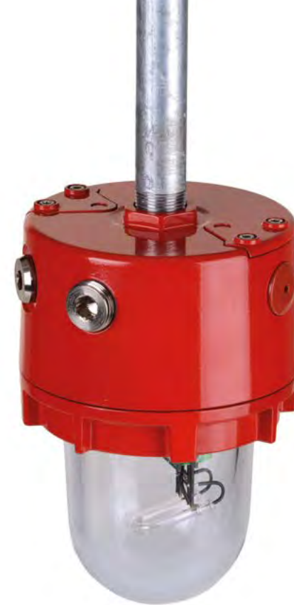
D1xB2XH1/XH2 - pendant mounting