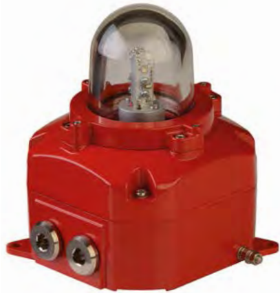
D2xB1XH1 / D2xB1XH2