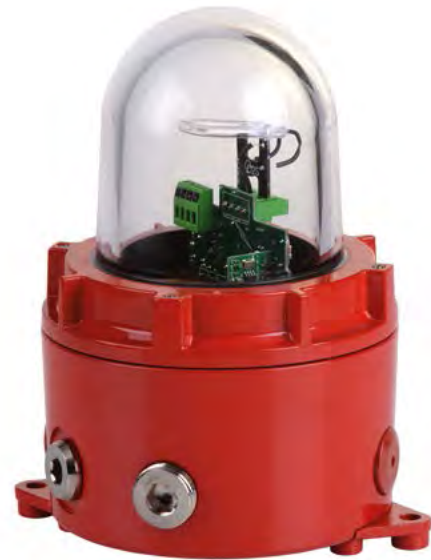
D1xB2XH1/XH2 - surface mounting