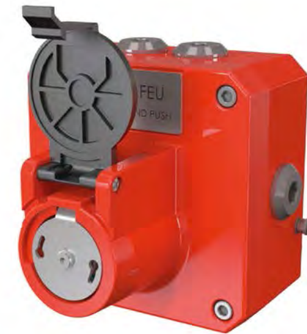
GNECP7-PT / GNECP7-PM