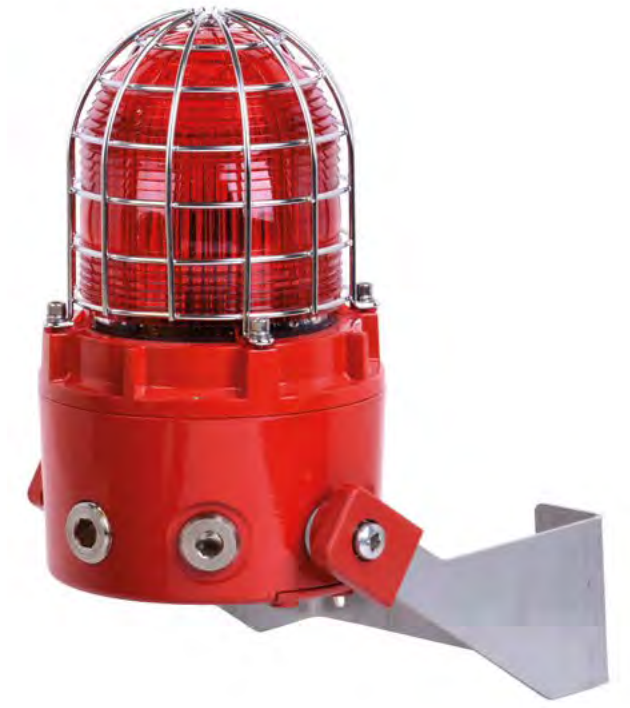
D1xB2 beacons - bracket mounting allows beacon to be rotated in any orientation