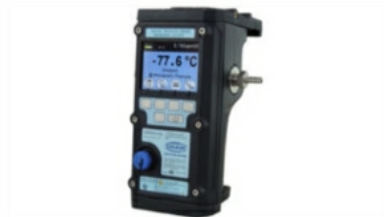
Portable Dewpoint Meters & Hygrometers

Portable dewpoint meters, hygrometers and moisture analyzers