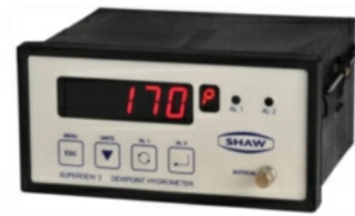
Inline Moisture Analyzers

All Moisture Meters portable dewpoint meters and hygrometers are fully self-contained and combine robust construction advanced electronics