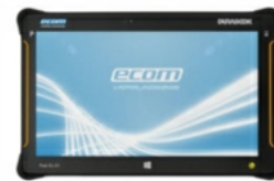
Explosion-Proof Tablet Computer

Efficient solution for challenging scan operations in explosion-hazardous areas