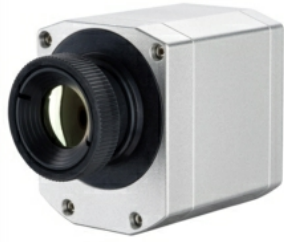
Infrared camera PI 640i

The thermal imager optris PI 640i is the smallest measuring VGA infrared camera worldwide