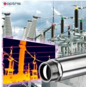
Xi 410: Compact industrial imager

The thermal imager optris PI 640i is the smallest measuring VGA infrared camera worldwide