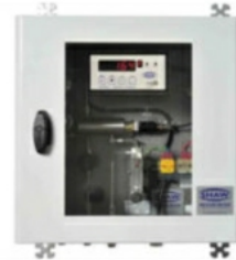
Sample System for Process Air or Gas Analysis

Designed with the operator in mind, for reliable and accurate measurements, the SHAW Model SDT and SDT-Ex are extremely easy to install and operate, requiring little or no maintenance