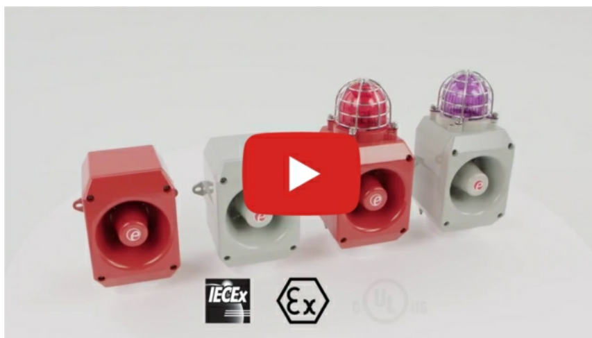
Hazardous Area - Fire Industrial - Wide Area Signaling

World leading independent manufacturer of high performance audible and visual signals for commercial, industrial, marine, onshore and offshore hazardous locations