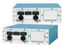
MGB1000 Micro Gas Blende