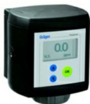
Oxygen and Toxic Gas Detection