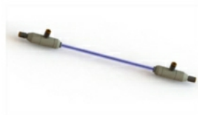
MRD Series Gas Dryers