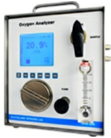
Industrial Oxygen Analyzers