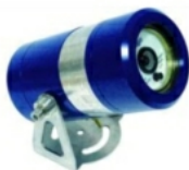
Optical Flame Detection