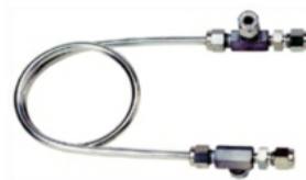
MD Series Gas Dryers