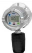
Carbon Dioxide, Hydrocarbons, and Combustible Gas Detection