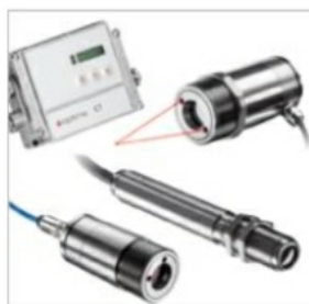
Infrared Thermometers - Pyrometers