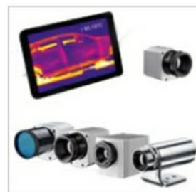
Infrared Cameras - Thermal Imagers