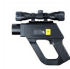
Handheld Laser Thermometers