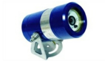
Optical Flame Detection