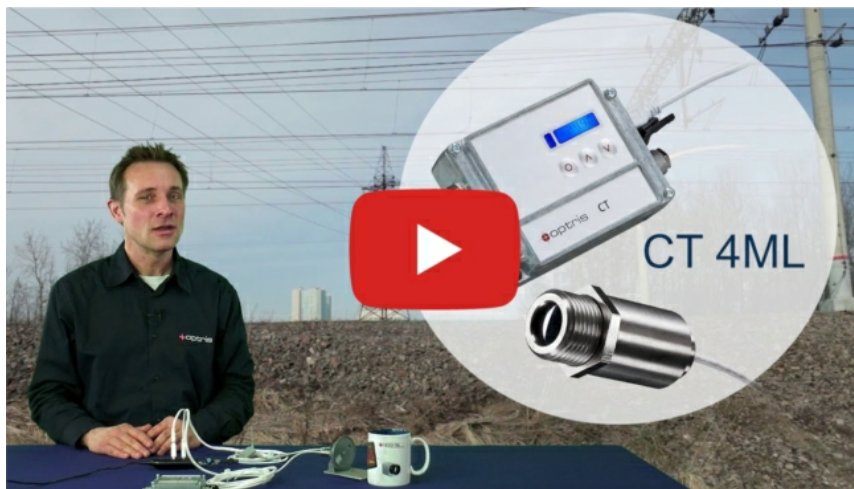
High Speed Pyrometer for Fast Moving Objects