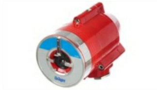
UV-IR Flame Detection