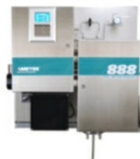
Sulfur Recovery Unit Analyzers