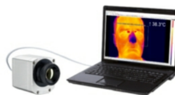
Fever Screening Systems