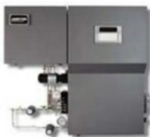
Chlorine Dioxide Analyzer