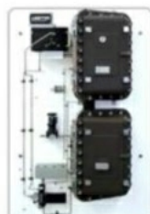
Hydrogen Sulfide Analyzers