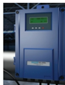
Ultrasonic Clamp-on Flowmeter