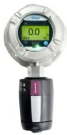
Draeger Polytron 8900