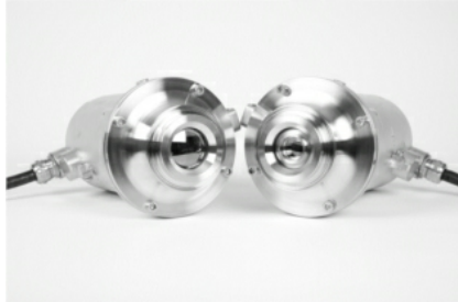
LaserGas III Ultra