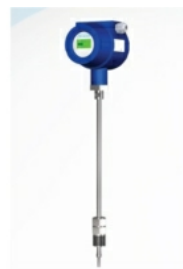
Thermal Mass Flowmeter