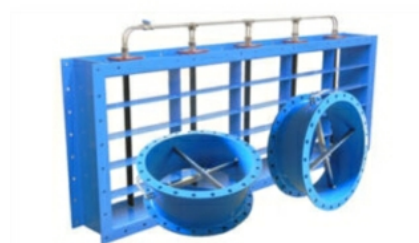
Duct Section Pitots