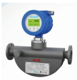
Coriolis Mass Flowmeter