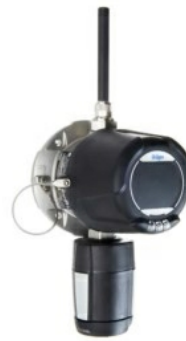
Draeger Polytron 6100