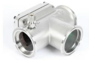
T-Flange Solution Gas Analyzers