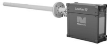
LaserGas iQ2 Vulcan