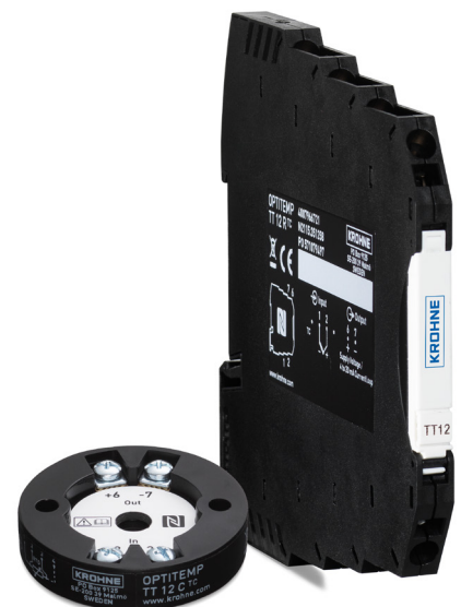
OPTITEMP TT 12 C TC