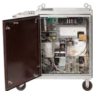
RefinIR laboratory system