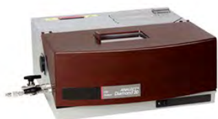
Diamond 20 lab system