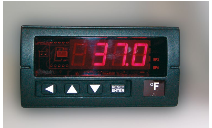
Digital display panel meter provides power and display; relays are optional.