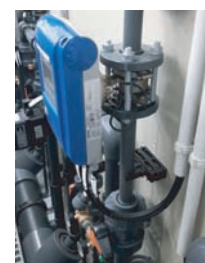
OPTIFLUX 5100 for dosing of sodium hypochlorite solution