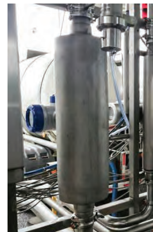
Flow measurement at raw milk reception with the OPTIMASS 1400

The dairy is very pleased with the performance of the KROHNE mass flowmeter. The customer decided that the OPTIMASS 1400 would become the default selection for this measurement. It is now the standard Coriolis meter for milk reception and will gradually be replacing other Coriolis meters installed for this application.