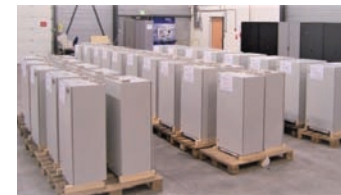
KROHNE control cabinets ready for shipping