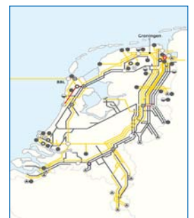
Gasunie infrastructure in the Netherlands