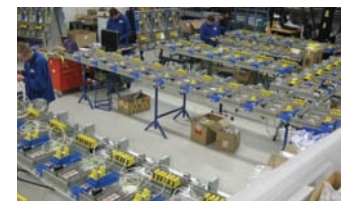
Flow computer manufacturing at KROHNE in Breda, the Netherlands