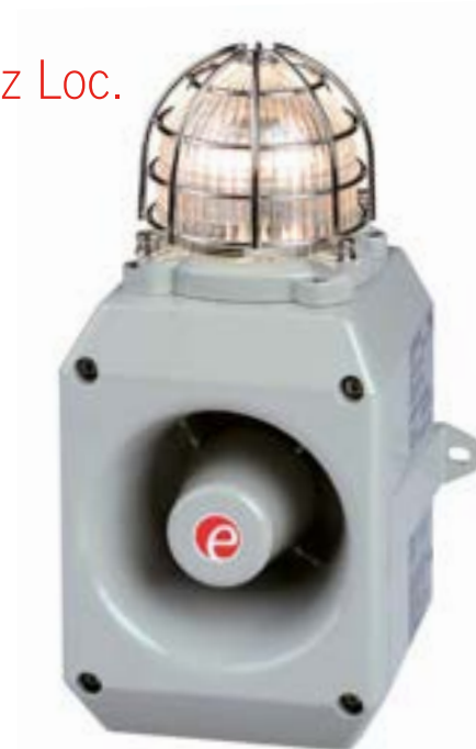
D2xC1X05 / D2xC1X10