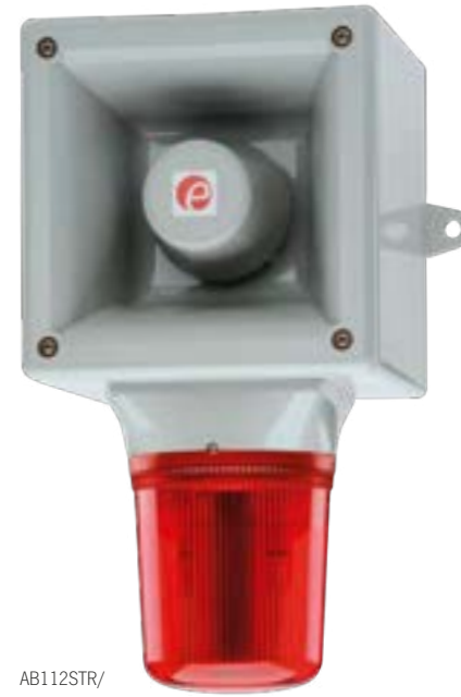
AB112STR/ AB112LDA/ AB112RTH