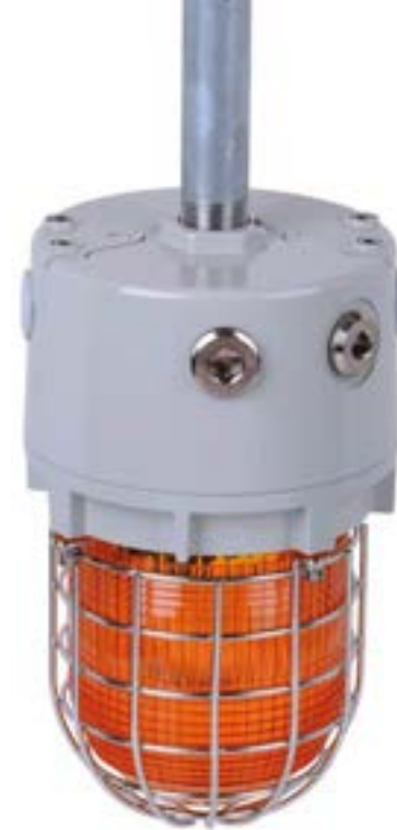
D1xB2 beacons - pendant