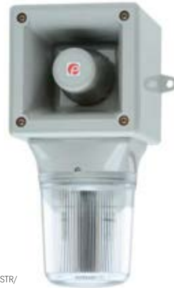
AB105STR/ AB105LDA/ AB105RTH