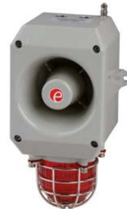
D2xC1X05 / D2xC1X10