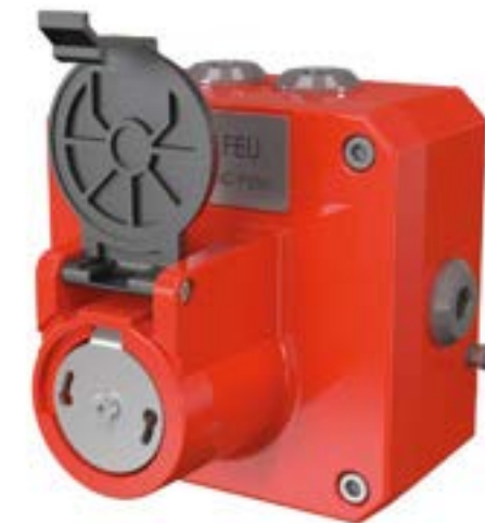
GNECP7-PT / GNECP7-PM