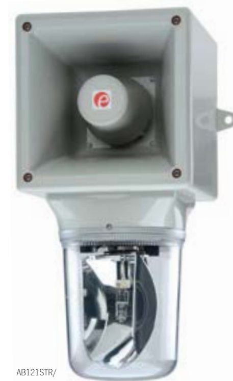
AB121STR/ AB121LDA/ AB121RTH

The SpectrAlarm range combines the AlertAlarm audible devices with the Spectra beacons to create a series of products optimized for industrial signaling applications.