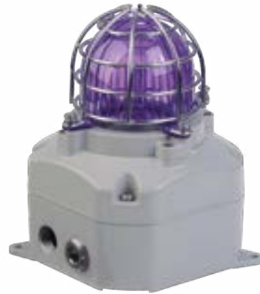
D2xB1X05 / D2xB1X10