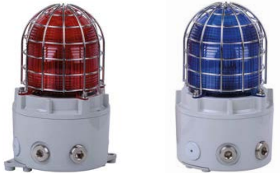
D1xB2 beacons- surface mounting