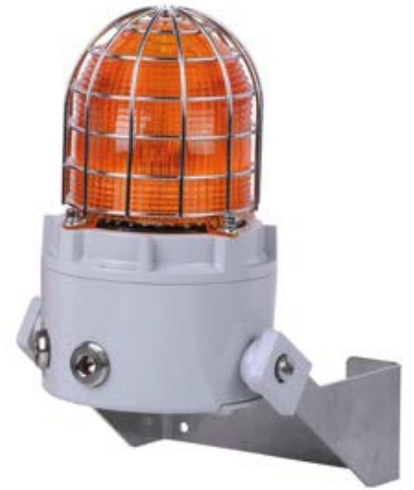
D1xB2 beacons - bracket mounting allows beacon to be rotated in any orientation

The globally approved D1xB2 family from E2S offer the most comprehensive range of solutions for UL1638 signaling in Class I/II Div 1 or Zone 1/20 explosion proof applications..