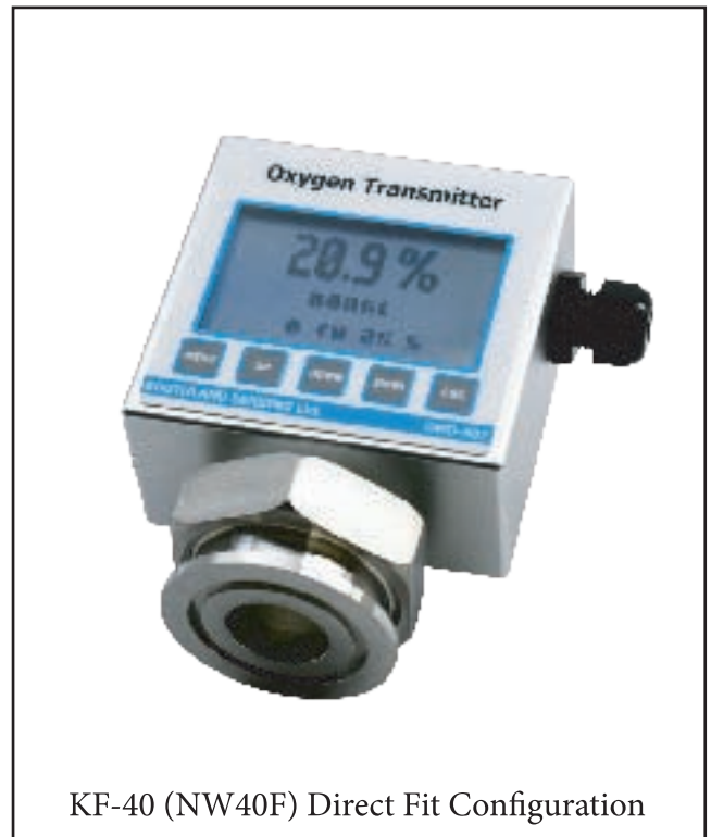
KF-40 (NW40F) Direct Fit Configuration